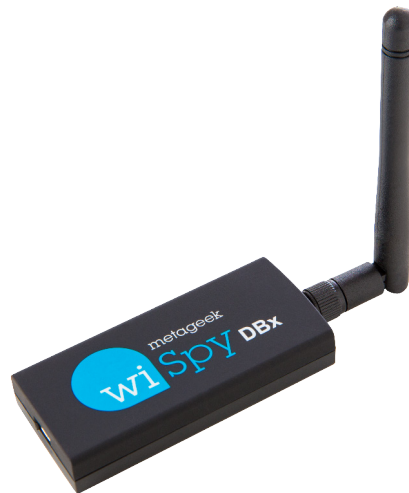
Wi-Spy DBx 2.4 GHz & 5 GHz