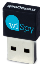
Wi-Spy Mini 2.4 GHz